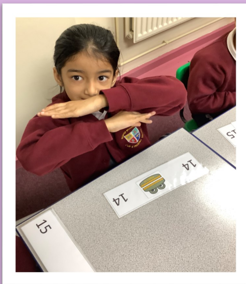
Below: L4 are demonstrating the equal to and lesser than signs used in maths.