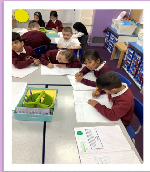
Above: Children from L4 practicing their handwriting—using capital letters